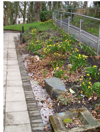
The work of the Eco Gardeners Before and After