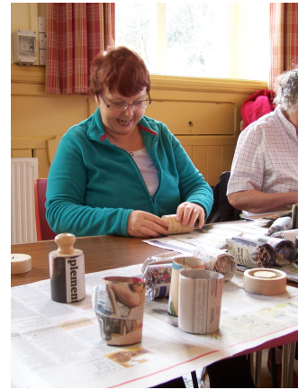
Church members and friends at the 'Sowing Saturday'