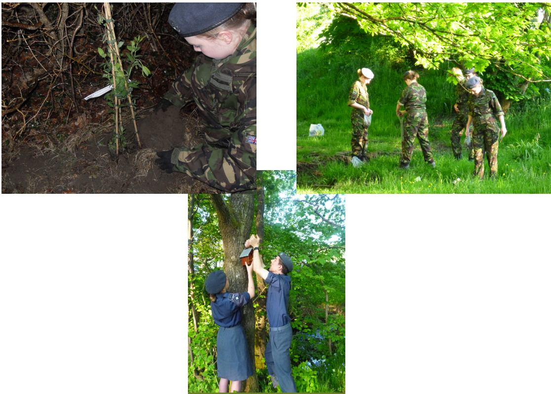
Illustrating the Cadets planting trees, bulbs and refurbishing the damaged bird box.

All the cadets have been actively involved, the staff have been keen too!