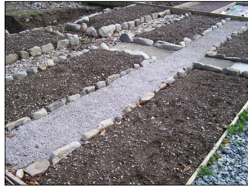
The site before and during development