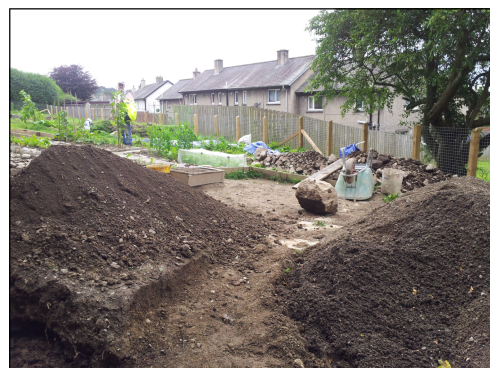
Laying the ground work