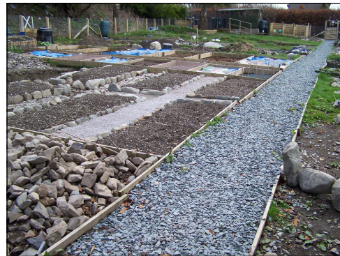
Plots marked out and preparation of ground.