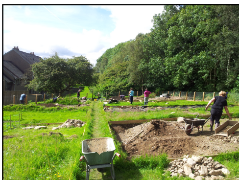
Plot holders working on site