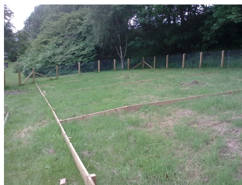
Plots being marked out prior to the start of digging