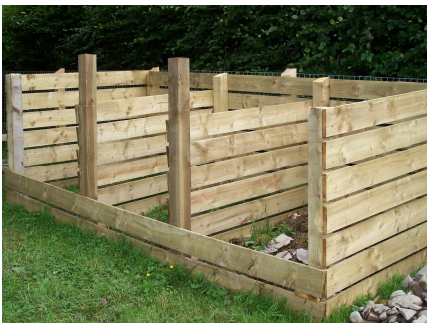
New composting area