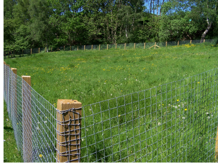
Site as it was in May 2012