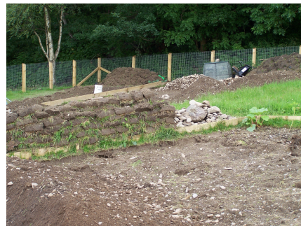
Laying the ground work