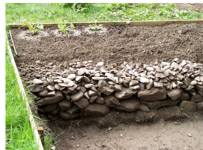
Progress made since May 2012