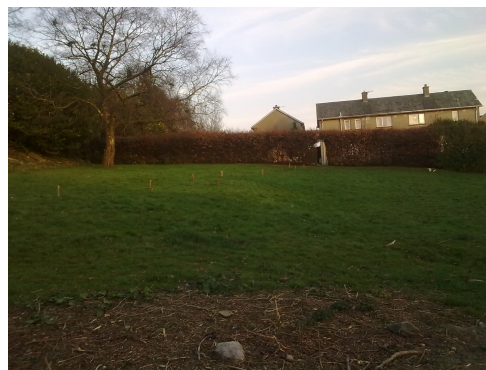
The site before development